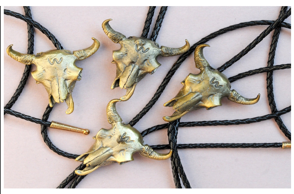
WI Bola Ties are finally available again

To learn more about the WHA Conference or to register go to www.westernhistoryassociation.org