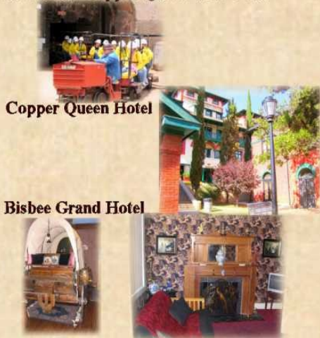
Copper Queen Hotel

Saturday, March 9, 8:45 A.M. Meet at the Copper Queen Mine Tour