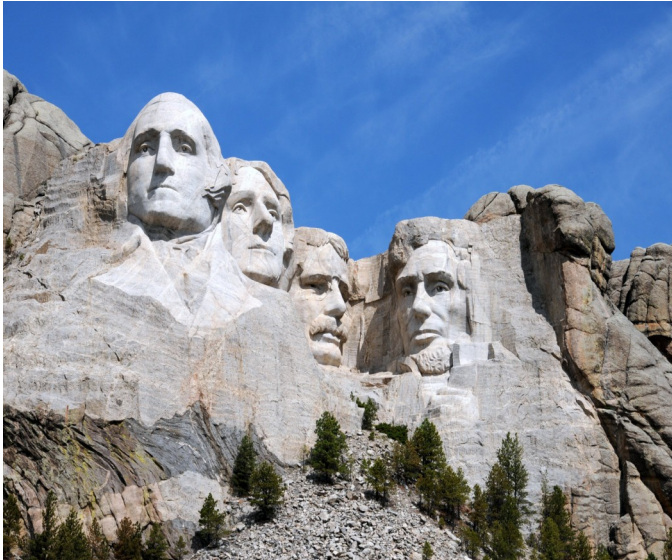
Premier landmark in the Black Hills of South Dakota — The Presidents, above. A fall attraction is the Buffalo Roundup.