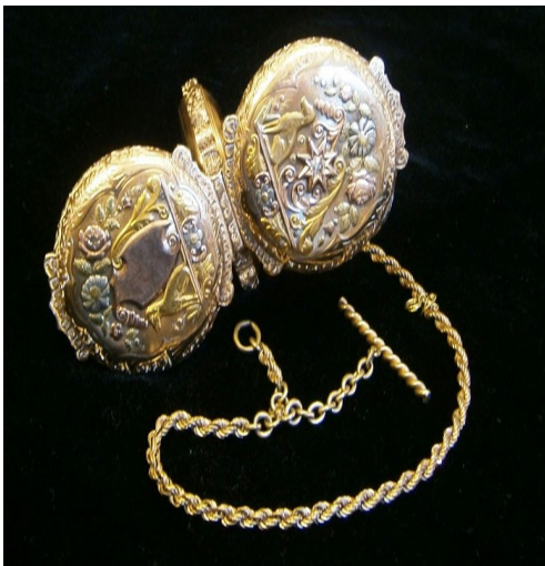
Here is a view of the very ornate case of the Buffalo Bill watch. More pictures on page 3.

Judy distinctly remembered a group called The Friends of Buffalo Bill purchasing the ornate watch in the late 1970's for $10,000 and wondered what had become of it. The Friends of Buffalo Bill had gradually