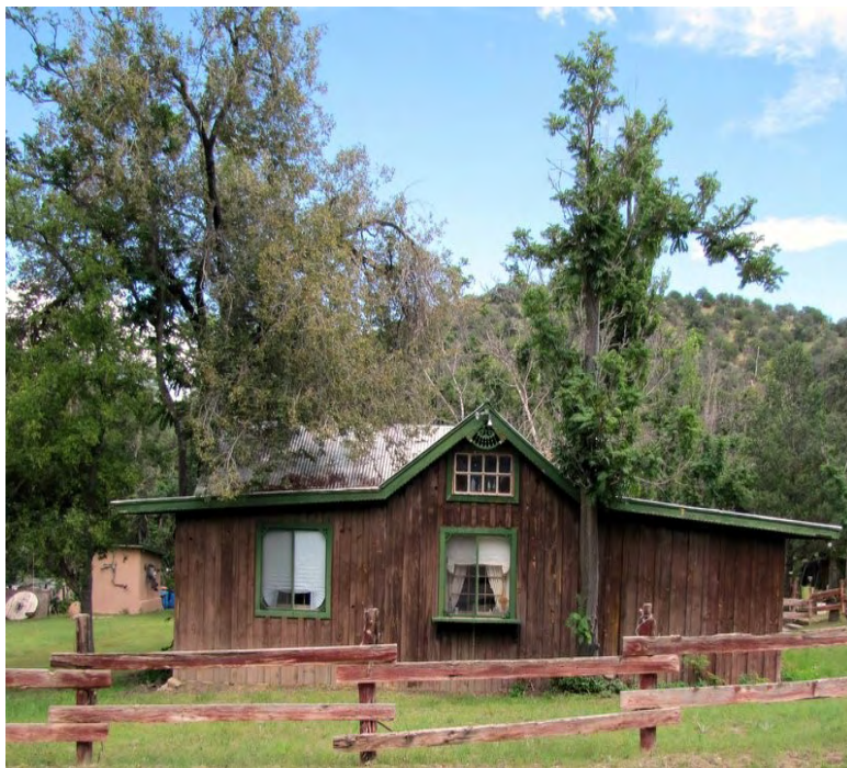
A few people still live in Paradise