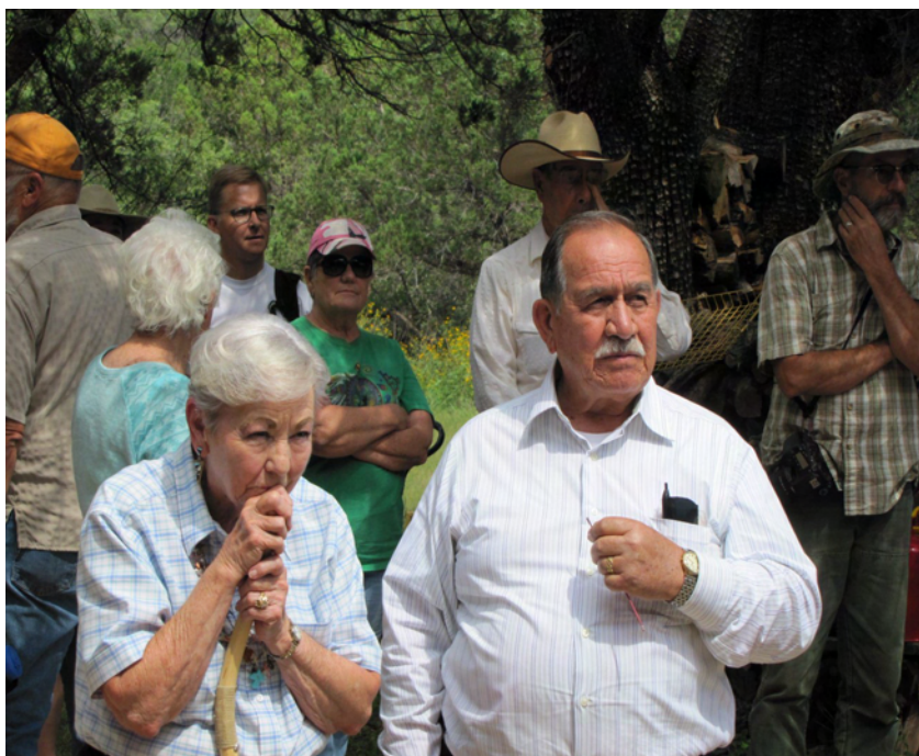
The group listens intently to the local tour guides. More pictures are on the WI Extra pages.

Everyone enjoyed themselves and were thrilled to visit and learn about this remote, forgotten treasure.