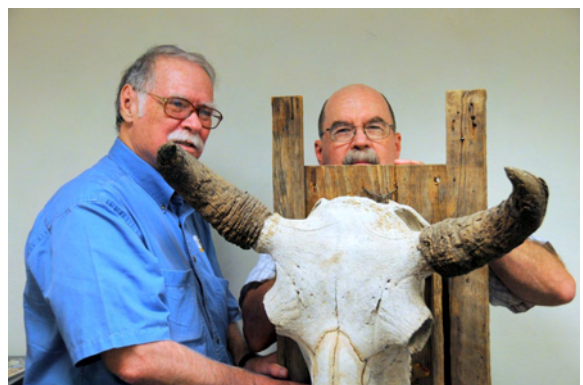
Chisholm Trail Corral