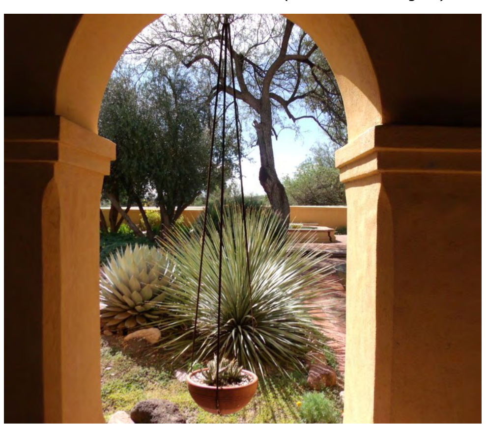
Above is a view of the garden at the Tumacacori Mission. More pictures are on WI Extra page 1 on website.

We pushed on to the Museum of the Horse Soldier in Trail Dust Town. This private collection of cavalry equipment, uniforms and weapons has got to be the finest and best organized anywhere in the country. Curator Rae Whitley gave us a guided tour that informed on much of the history of the mounted soldier. Our dress uniforms followed French, Prussian, British, French then Brit-(Continued on Page 7)