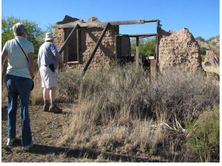
From the ghost town of Ruby—above the remains of the Ruby Merchantile. Right is the town Jail.