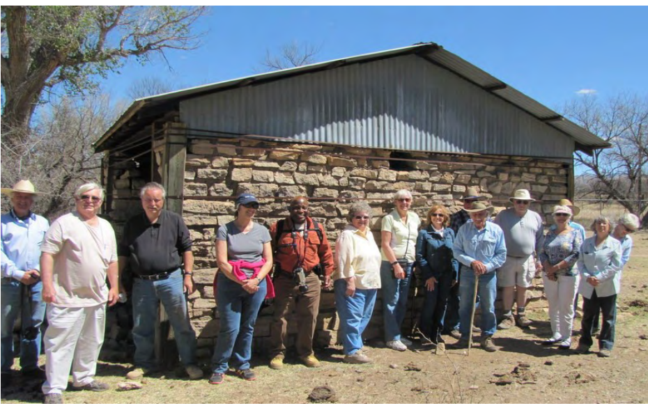
A group of Westerners pose outside the Pennington House