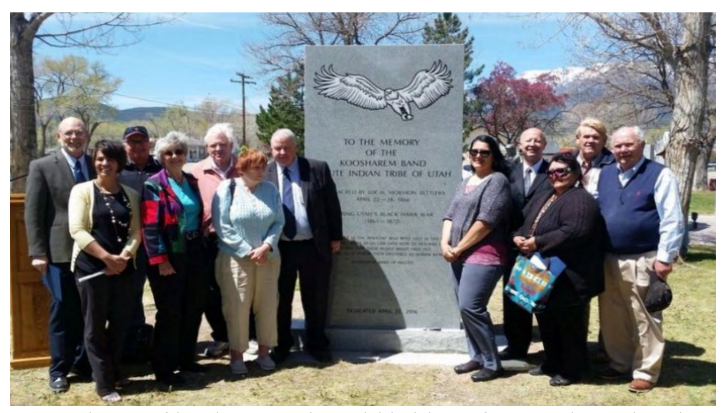
Pictured are some of the Utah Westerners who attended the dedication of a monument honoring the 150th Anniversary of the massacre of members of the Piaute Tribe during the Black Hawk War.